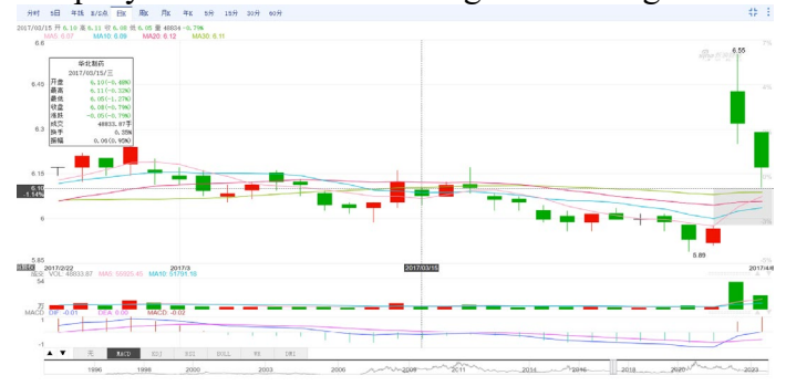
Figure 2 K chart of North China Pharmaceutical Company Ltd. stock price

exposed the greenwashing behavior of enterprises, the stock price of North China Pharmaceutical Company Ltd. generally showed a downward trend, indicating that the market efficiency of North China Pharmaceutical Company Ltd. declined after its greenwashing behavior was exposed.